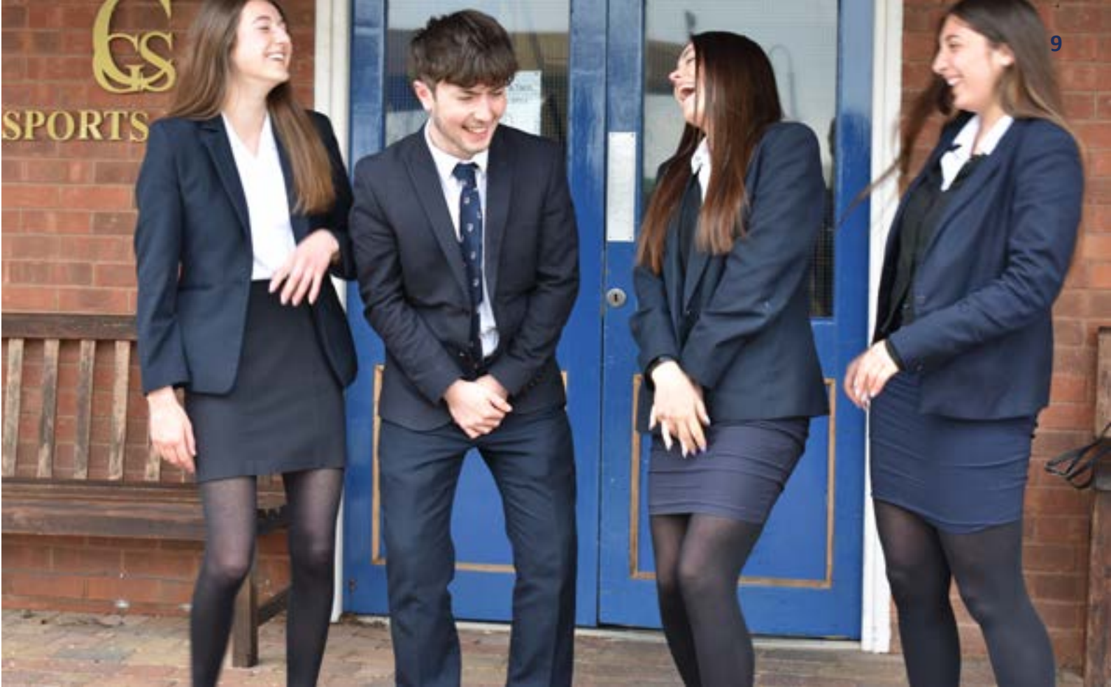
Year 10 Timetable